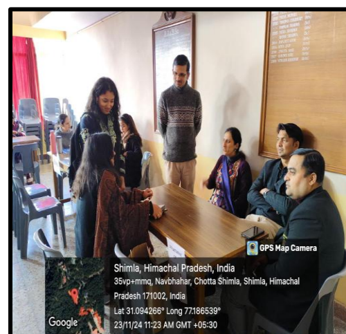
Glimpses of the Parent Teacher Meeting